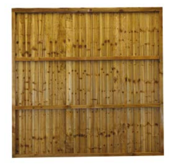
Rear view Pressure Treated Brown