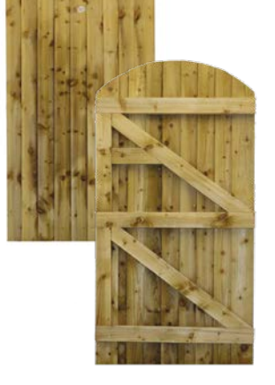
Pressure Treated Green